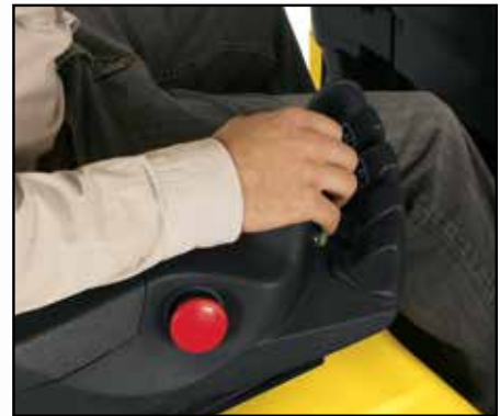
TouchPoint E-hydraulic mini-lever controls