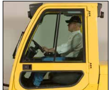
Optional cab shown