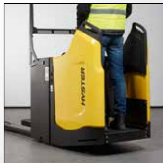
FIXED SIDE PROTECTION WITH REAR ACCESS