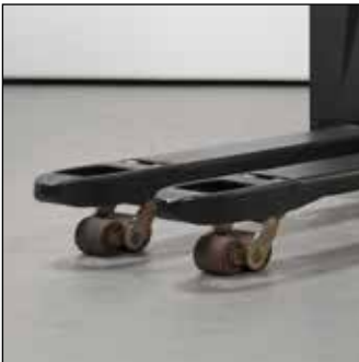
TWO FORK HEIGHTS