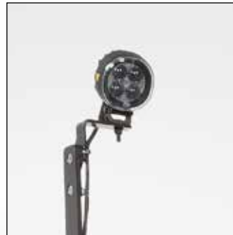
PEDESTRIAN AWARENESS LIGHTS