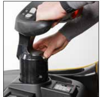
ADJUSTABLE SCOOTER CONTROL