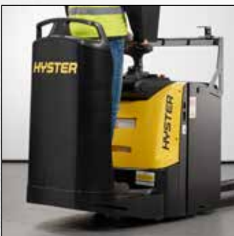
FIXED REAR PROTECTION WITH SIDE ACCESS (VIA SPECIAL ORDER)