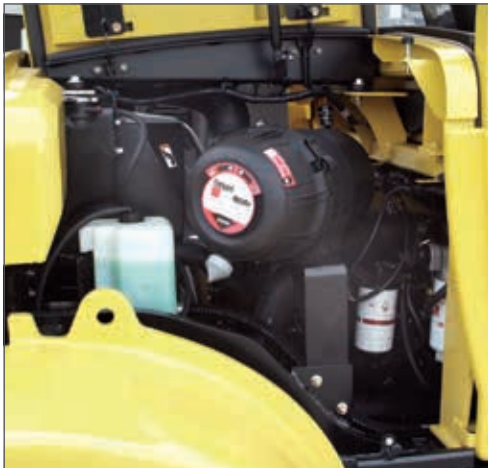
Easy service access