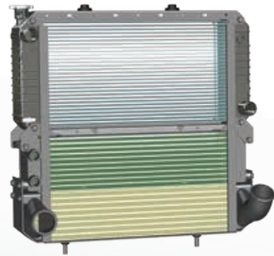
Diesel radiator features air to air intercooler technology