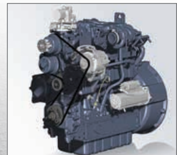
High output Kubota 3.8L turbo diesel engine