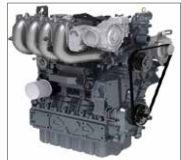
Kubota 3.8L LPG engine