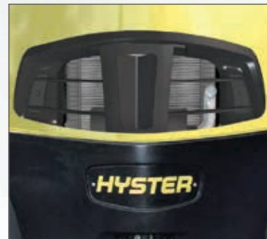
Counterweight tunnel design