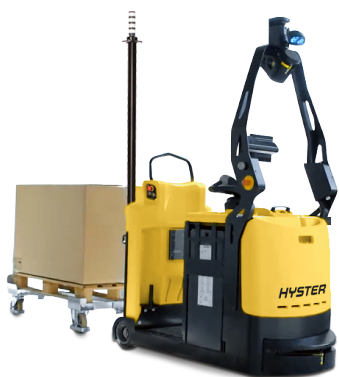
Robotic tow tractor

Pick up floor level loads and deposit them in storage locations.