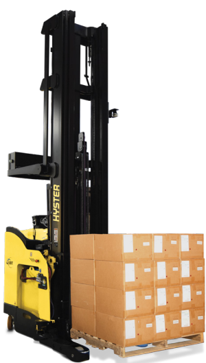
Robotic reach truck