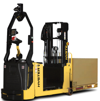
Robotic counterbalanced stacker

Collect waste throughout the shop floor, avoiding unproductive downtime between primary trips.