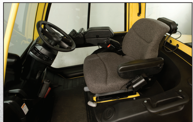
Ergonomically designed operator compartment