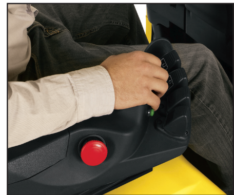
TouchPoint E-hydraulic mini-lever controls