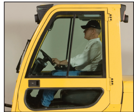
Optional cab shown