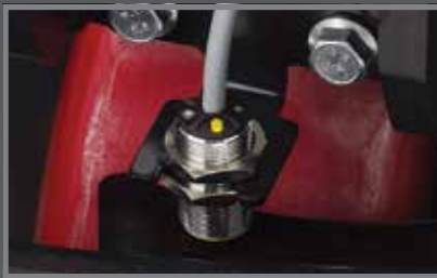
Hyster Intelligent Slow Down™ Sensor

Hyster Company has shortened the fork tip length of the W45Z HD and designed a low-profile bumper to provide a tight right angle turn for easier right angle stacking, equal aisle placement, and improved maneuverability within a trailer. Fork tips feature a tapered fork nose and blunt ends to allow for repositioning of pallets and enhances pallet entry. The design is ideally suited for pinwheeling applications which allows the customer to put 10% more pallets on each truck, reducing per pallet transportation costs.