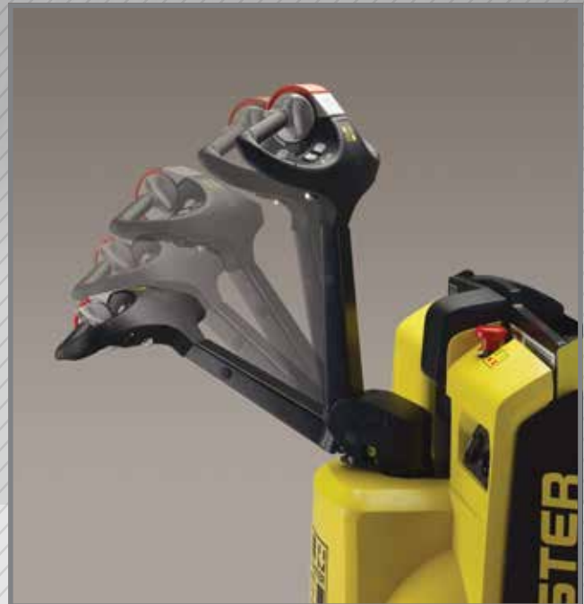
Largest run zone in the industry allows for comfortable operation.

The ergonomically designed handle minimizes wrist movement and provides a solid grip for additional control while operating the unit in all applications. Lift, lower, and horn push buttons are conveniently located at the operator's fingertips for easy access without having to release the hand from the grip. The butterfly throttle control provides a high level of controllability when selecting direction and speed, minimizing operator fatigue.