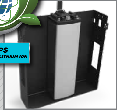
Lithium-Ion Advanced Performance Power System