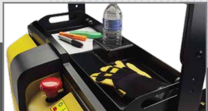
The W45Z HD with factory installed batteries includes an operator convenience tray with large storage area for stowing clipboards, pens, pencils and other items. Units equipped with a 9" battery box have several convenience tray options. (9" battery box option shown)