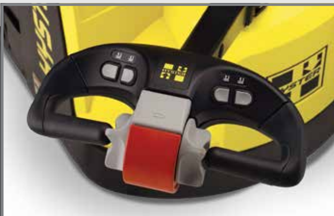
Ergonomically designed control handle.